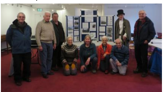
ÀRAINNEACHD EACHDRAIDHEIL ALBA

But additionally there were a number of estate roads, some later becoming adopted by the county. As a result, Telford's work in the area to some degree filled in gaps. Unlike more remote areas in the Highlands, Telford did not construct any Parlimentary churches, but he did build two manses, both surviving to this day.